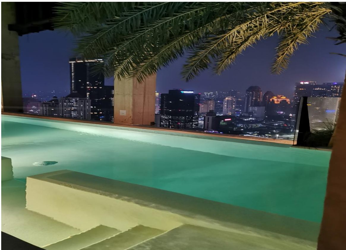
Cafe Cali at night! Their desserts are amazing too!

It is not an easy place to stay if you compare other universities and cities, but it can be a rewarding experience and a place for you to really grow and challenge yourself. Do not be too hard on yourself if at the beginning you are struggling, I have spoken to many expats and this is a very common experience. I myself experienced this, but keep an open mind and heart, positivity, and create the life you want to have during this semester. It will make all the difference and Indonesia really will have a special place in your heart after all is said and done, and you will be wishing you were back there as soon as you land. I promise you that! If you have any questions you can reach out to me :)